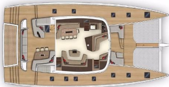
Cabine et cockpit / Saloon and cockpit