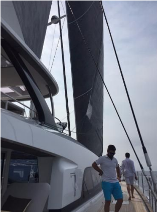
SEA TRIAL HAREL YACHTS