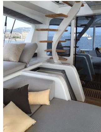
SEA TRIAL HAREL YACHTS