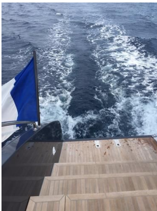
SEA TRIAL HAREL YACHTS