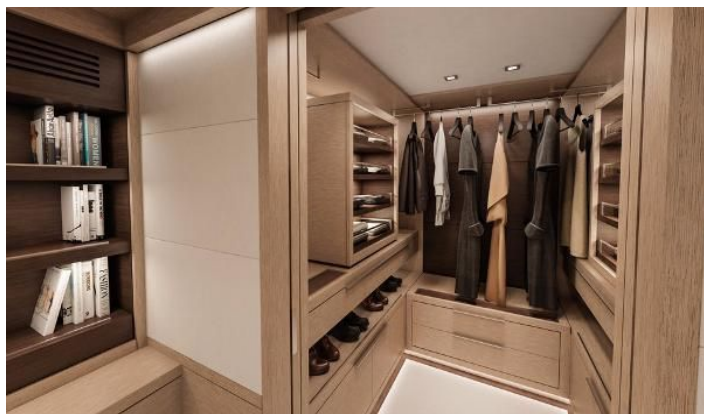
In dressing / the dressing