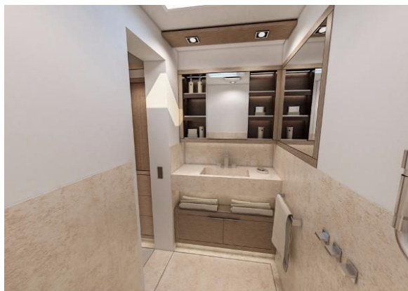
In the deck cabin / the bathroom