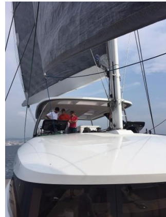
SEA TRIAL HAREL YACHTS