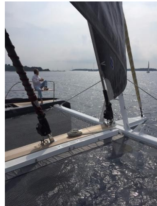
SEA TRIAL HAREL YACHTS