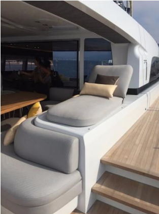
SEA TRIAL HAREL YACHTS