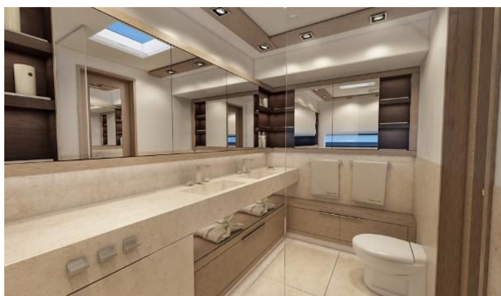
In the deck cabin / the bathroom