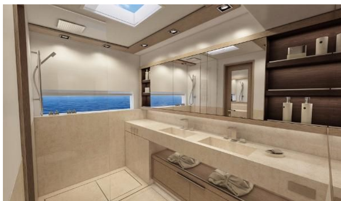
In the deck cabin / the bathroom