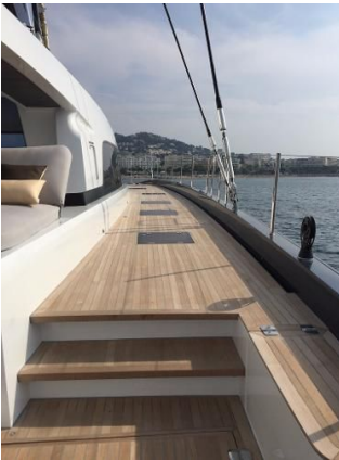
SEA TRIAL HAREL YACHTS