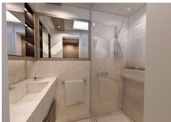
In the deck cabin / the bathroom