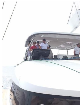
SEA TRIAL HAREL YACHTS