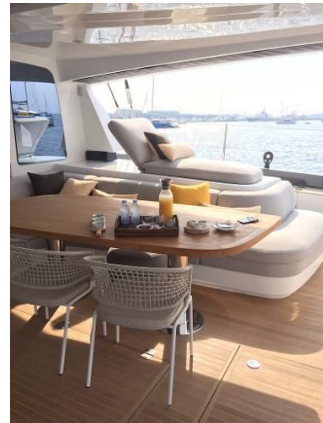
SEA TRIAL HAREL YACHTS